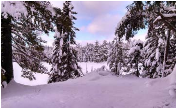
View of Katherine Lake during trail clearing [J. Kettle]