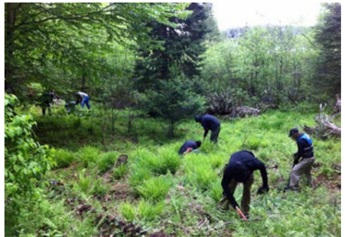
University of Dubuque students and staff pulling thistles in the forest