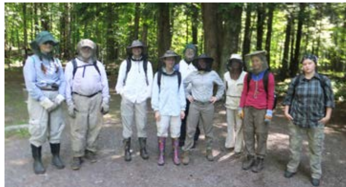
Sierra Club & FoS Invasives Crew members ready for work and bugs [D. Wallace]

After a very successful service trip in June of 2013, FoS again organized an invasive weed removal project through the Sierra Club in June of 2014. The intention was to camp at Whitefish Lake for 4 days and remove thistle rosettes to minimize future work during the busy growing season. With the oppressive mosquito population and good input from the group we made the wise choice to use the Conserve School as our base and attack the thistles on day trips. This allowed us to keep our sanity, cook in a fine facility and enjoy the good company in a comfortable dorm. A significant amount of work was accomplished and we had a fine time. When we returned during the flowering season with the FoS invasives crew, their work went much faster thanks to this effort. We thank the Conserve School for their generous hospitality. If you are interested in assisting with this effort in June of 2015 please contact Dan at djwallac@wisc.edu . D. Wallace