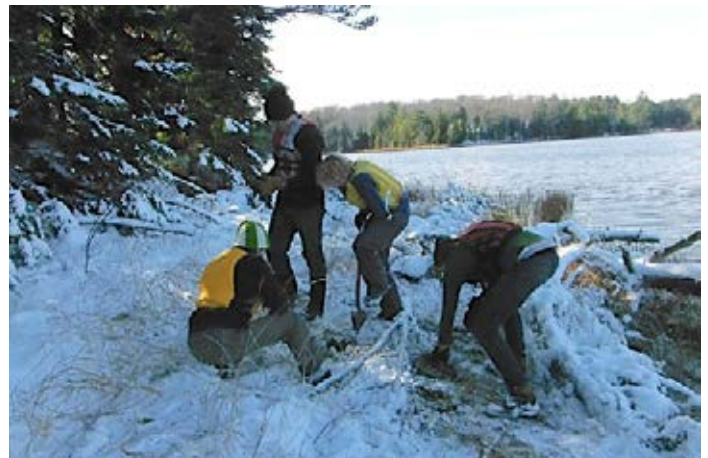
Conserve School students working in the snow, removing thistles