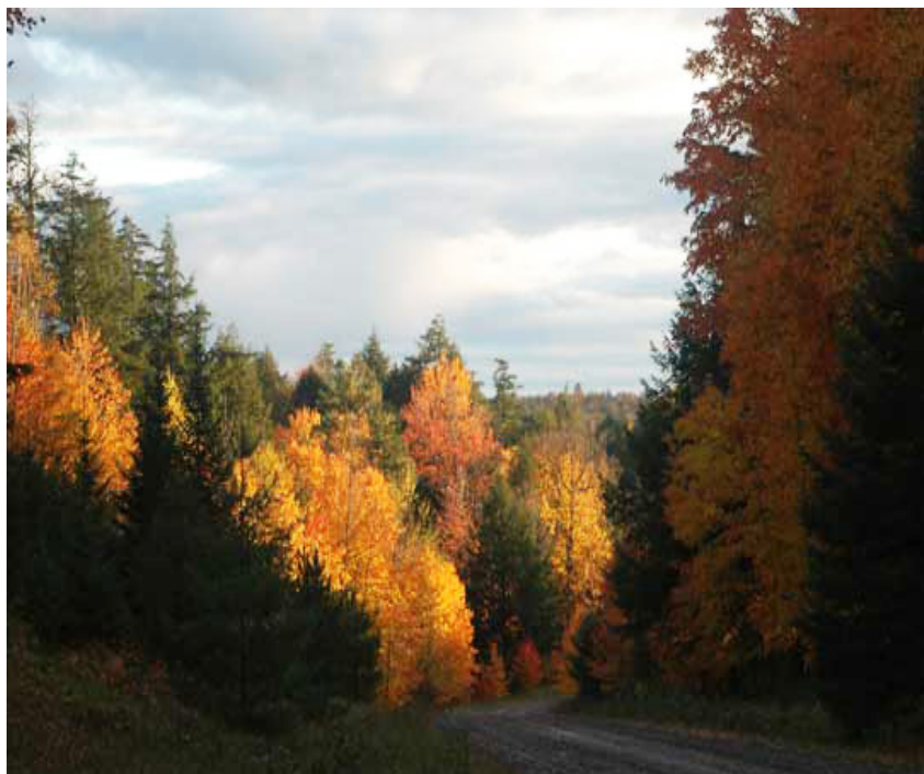
Road to Clark Lake in fall [W. Brinkmann]

The Clark Lake Day Use Building was completely renovated and modernized, inside and out. A completely new water system and septic system were installed, which include modern bathroom and shower facilities. The exterior of the building had some siding replaced and repaired, a new roof was installed, and a new color scheme was chosen! The Ottawa National Forest (ONF) hopes you enjoy the new green that will blend nicely with the surrounding area and fits in with the wilderness setting. Some work in the interior of the buildings will need to be completed early in the 2015 summer season, but ONF anticipates that the building will be open for much of the summer.