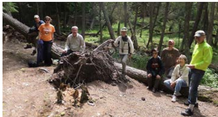
Wisconsin Natural Resources Foundation hikers

In conjunction with the 50th anniversary of the Wilderness Act, FoS organized and led an additional hike for the Wisconsin Natural Resources Foundation that “circumnavigated” Clark Lake. Participants appreciated the beauty and serenity (but not the rain) of the wilderness and the old growth forest.